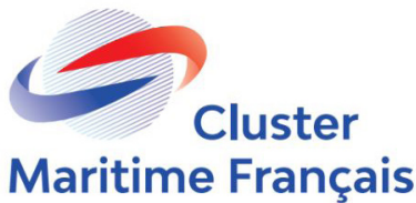
Cluster Maritime Français — France