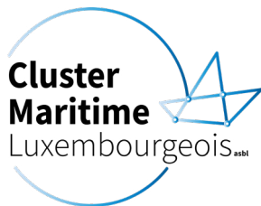
Cluster Maritime Luxembourgais — Luxembourg