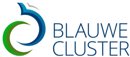
Blauwe Cluster — Belgium