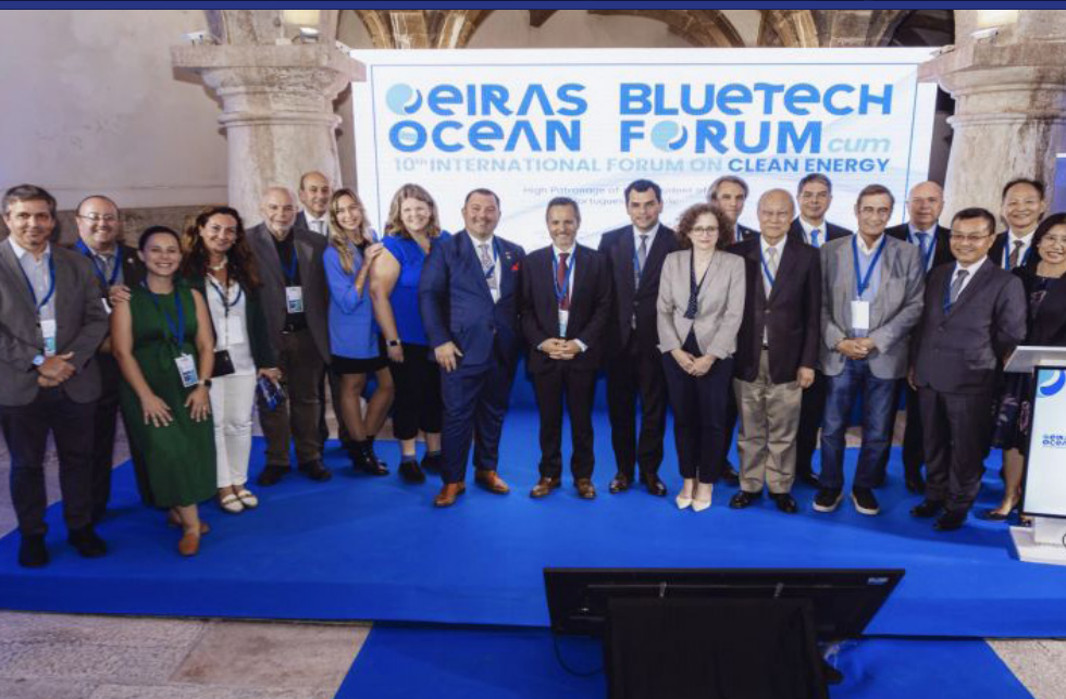
Oeiras, Portugal - October 16-17, 2024